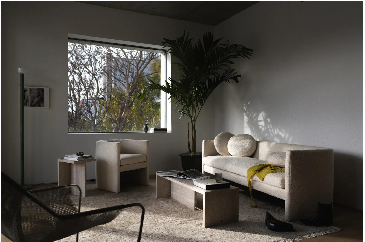
TRNK's residence at 450 Warren.