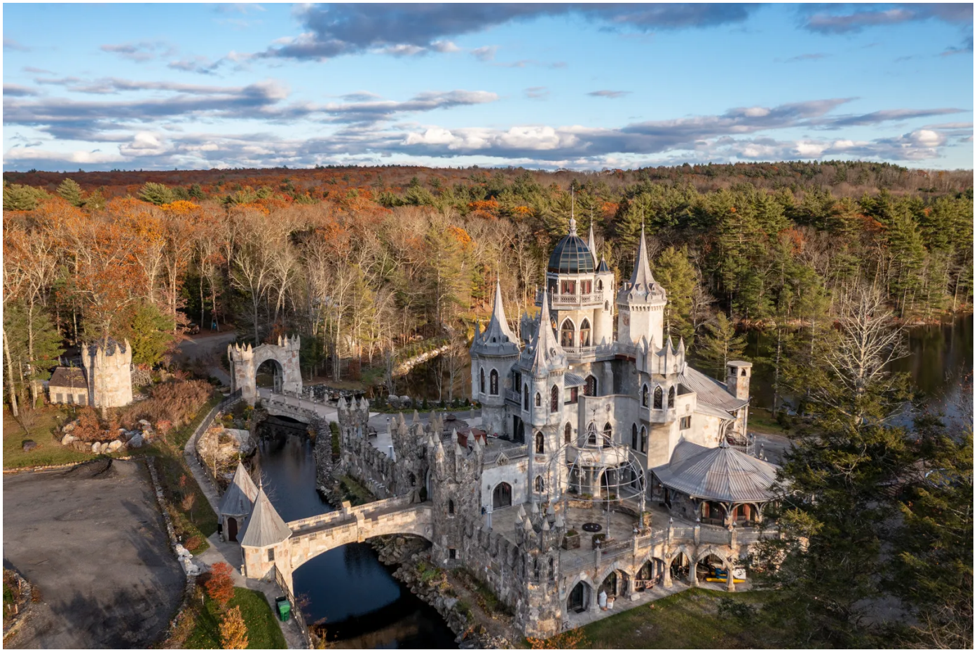
Christmark Castle.