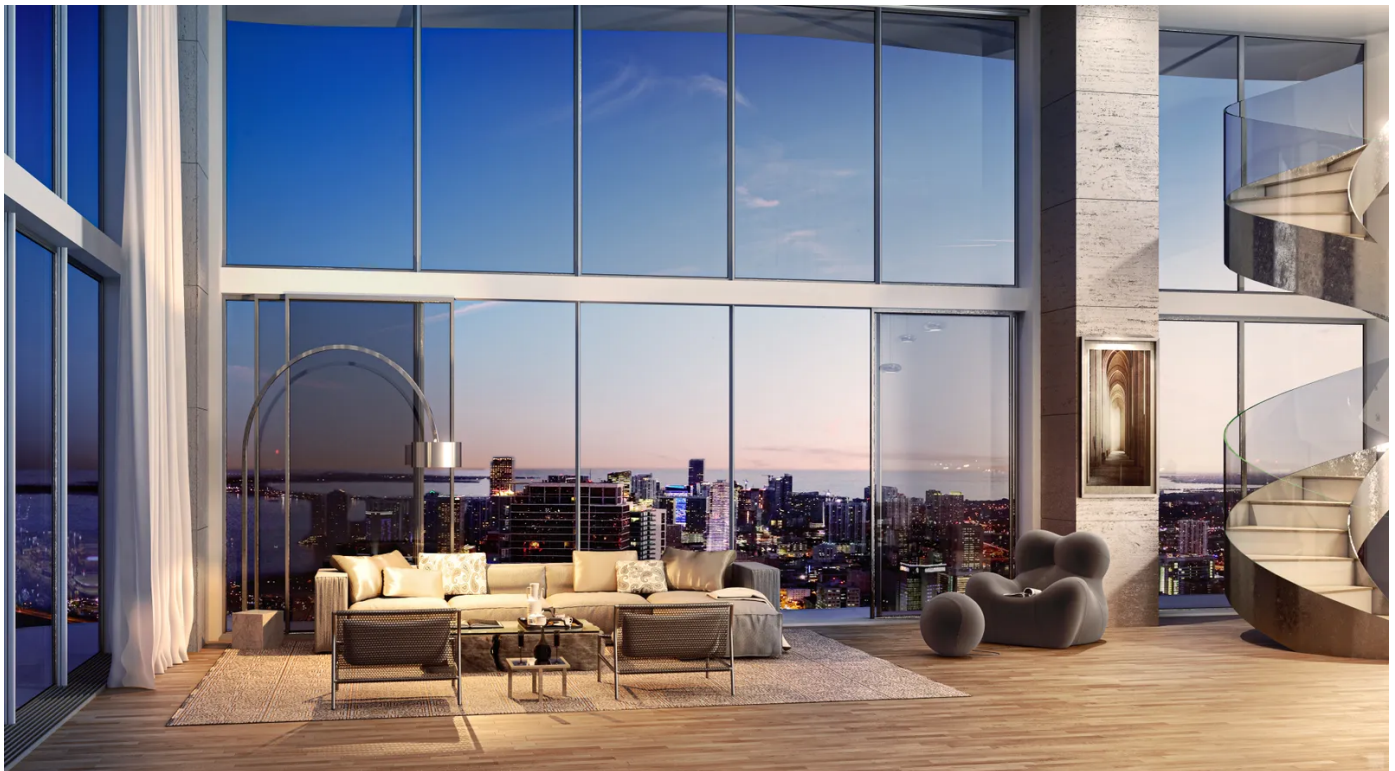
A preview of Casa Bella Residences by B&B Italia.

Sales are being handled exclusively by Fortune International Realty.