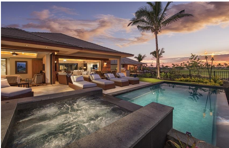
Back of detached home with bedroom and great room pocket sliding glass doors opened to lanai and private pool.

Francis H. I'i Brown South golf course and the homes have been designed to enjoy indoor-outdoor living and maximize views of the golf course and the Mauna Kea Volcano or Pacific Ocean. The gated community of 17 luxury homes consists of detached and paired homes ranging in price from approximately 2.5 to 4.5 million dollars. Each home has pocket sliding glass doors to the outside, a private pool and spa, and a top-of-the-line finishing package. There are six homes left to sell in The Residences of Laule'a, and only one award-winning detached home.