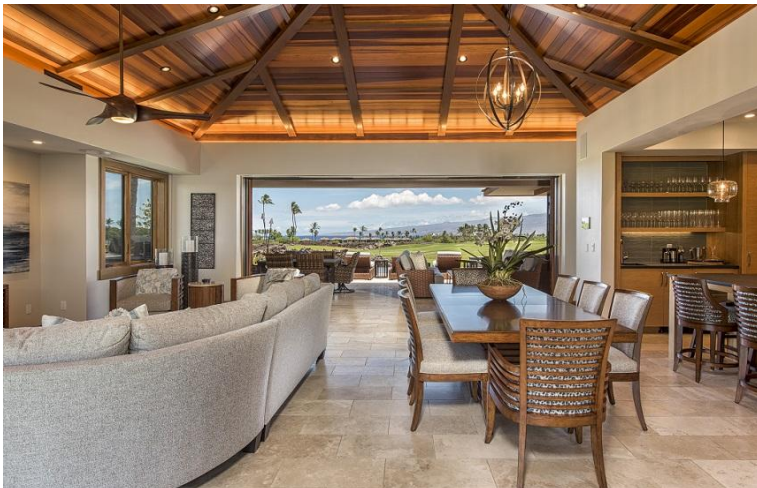
Ocean view from great room with pocket sliding doors opened to lanai and private pool.